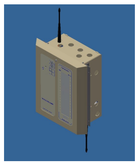
(Local source sending alarm 16 signals – part # PX-DU164-MS)