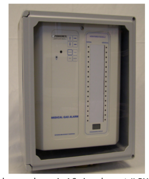
Master alarm shown above is 16 signals part # PX-SDU16-03

The Master Alarm Panel shall be the Powerex Master Alarm Panel. The panel shall be microprocessor controlled and designed to comply with NFPA 99. The panel shall be 100% digital and shall not require re-calibration. The panel shall be able to interface with building management systems with the use of an MCP circuit board. The master alarm panel shall be compatible with the T-Net PC based medical gas information management system. The alarm panel shall be enclosed in a steel box inside a NEMA 4X box and shall be designed to accept an electrical input range of 120-240 volts AC – 50-60 hertz. The source voltage shall be stepped down with a self-contained transformer. The